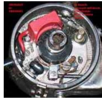
Left: 3BOS4U1 in distributor with 1-piece, right-hand points, Center: 3BOS4C2 in 010 non-vacuum distributor with 2-piece, right-hand points, Right: 3BOS4V2 in vacuum-advance distributor with 2-piece points