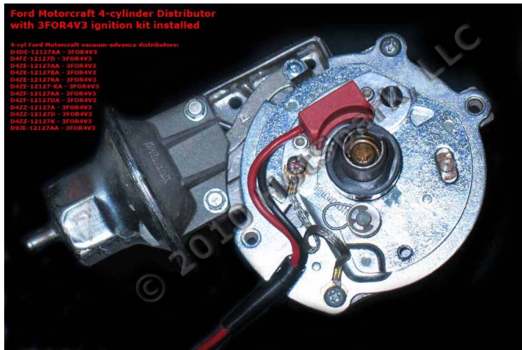
Above: 3FOR4V3 in 4-cylinder Motorcraft Vacuum-advance Distributor