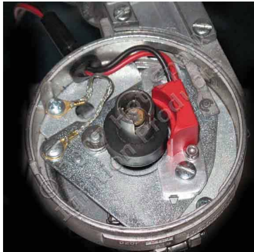
Left: 3FOR8U1 in Ford 8-cylinder Vacuum-advance Distributor